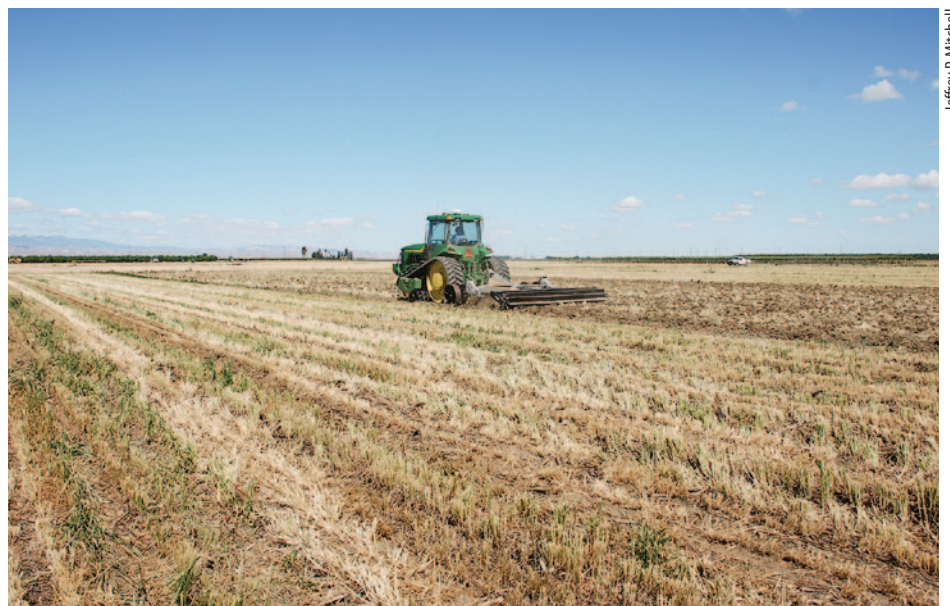
In Five Points, soil is disked to incorporate residues — the conventional practice. Transitioning to reduced-tillage practices could significantly improve water use efficiency in California agriculture.