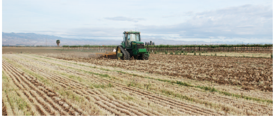
A 2-year study at the UC West Side Research and Extension Center in Five Points compared soil water content in tilled (right, subsoil ripped) and no-tillage (left) plots.

studies in 2009 and 2010 at the UC West Side Research and Extension Center in Five Points. We monitored the surface water content in a Panoche clay loam soil during the transition from wheat harvest to corn seeding under no-tillage and standard tillage. Each treatment plot consisted of fifteen 5-foot-by-300-foot beds and was replicated three times in a randomized complete block design. Following wheat silage harvest in late April of each year, the no-tillage plots were left undisturbed, while the standard tillage plots were disked twice, chiseled to an approximate depth of 1 foot and disked again before being listed to recreate 5-foot-wide planting beds for corn.