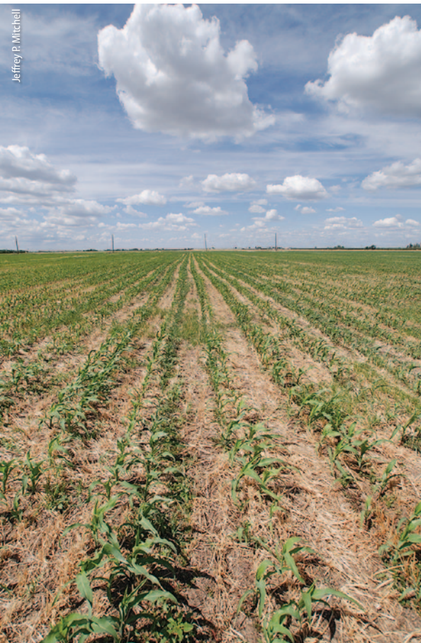
No-tillage corn grows in triticale and corn residues in Turlock.

Certain California cropping systems, such as dairy silage and small grain rotations, may initially be more amenable to being converted to no-tillage and to maintaining sufficient residue amounts than others. Surveys conducted by the Conservation Agriculture Systems Initiative, for instance, have documented that high residue levels are achieved in sustained no-tillage and strip-tillage dairy silage fields. Long-term studies with conservation tillage and cover-cropped tomato and cotton rotations in Five Points, and conservation-tillage corn and tomato in Davis, have also demonstrated the ability to maintain high residue levels while