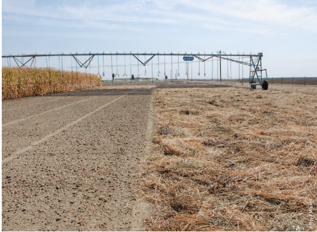
The water evaporation rate from plots with residue (example at right) was consistently lower than from bare-soil plots (left) after overhead irrigation, in Five Points.

closely the results of studies in Nebraska, where 0.08 to 0.1 inch (0.2 to 0.3 centimeter) of water evaporated from residue after wetting events (van Donk et al. 2010). They indicate that evaporation losses from residues can be significant, particularly if irrigation or rainfall is light and frequent. Evaporation of 0.1 inch from an 0.5-inch (1.3-centimeter) application is a 20% loss, which is significant (van Donk et al. 2010). Heavier or less-frequent irrigations would be more effective in decreasing the proportional water loss from residues; however, concerns about runoff at high application rates may limit an irrigator's option to do that. In this regard, no-tillage offers an advantage: sustained no-tillage allows higher irrigation rates before runoff, because changes in soil structure and porosity result in higher infiltration rates (Pryor 2006).